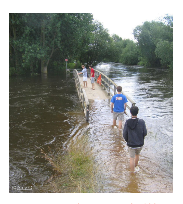
Communication and engagement should focus on preparedness - drawing on past experiences to be more prepared for future risks in a changing climate. What things can people do to help protect their home against flooding in

After a flood, communicators may feel compelled to encourage a community to try and get 'back to normal'; to restore a feeling of security and the familiarity of life before the flood. Certainly, there may be a strong drive towards this from communities themselves. However, getting 'back to normal' may not be possible in a changing climate, and future flooding could potentially be worse than previous episodes. There may also be items and possessions in people's homes that are damaged beyond repair. The Oxford workshop suggested that this can be one of the most traumatic aspects of experiencing a flood and part of this grief is coming to terms with the fact that there may have been things they could have done to prevent the damage. Communications should encourage people to rebuild their homes, but to make them more resilient, rather than exactly as they were before the flood. For some people, these changes will be small (such as learning how to modify their ventilation bricks), but for others, this may mean significant moderations to their house (such as heightening electrical sockets or having tiled floors) and for some even moving house.