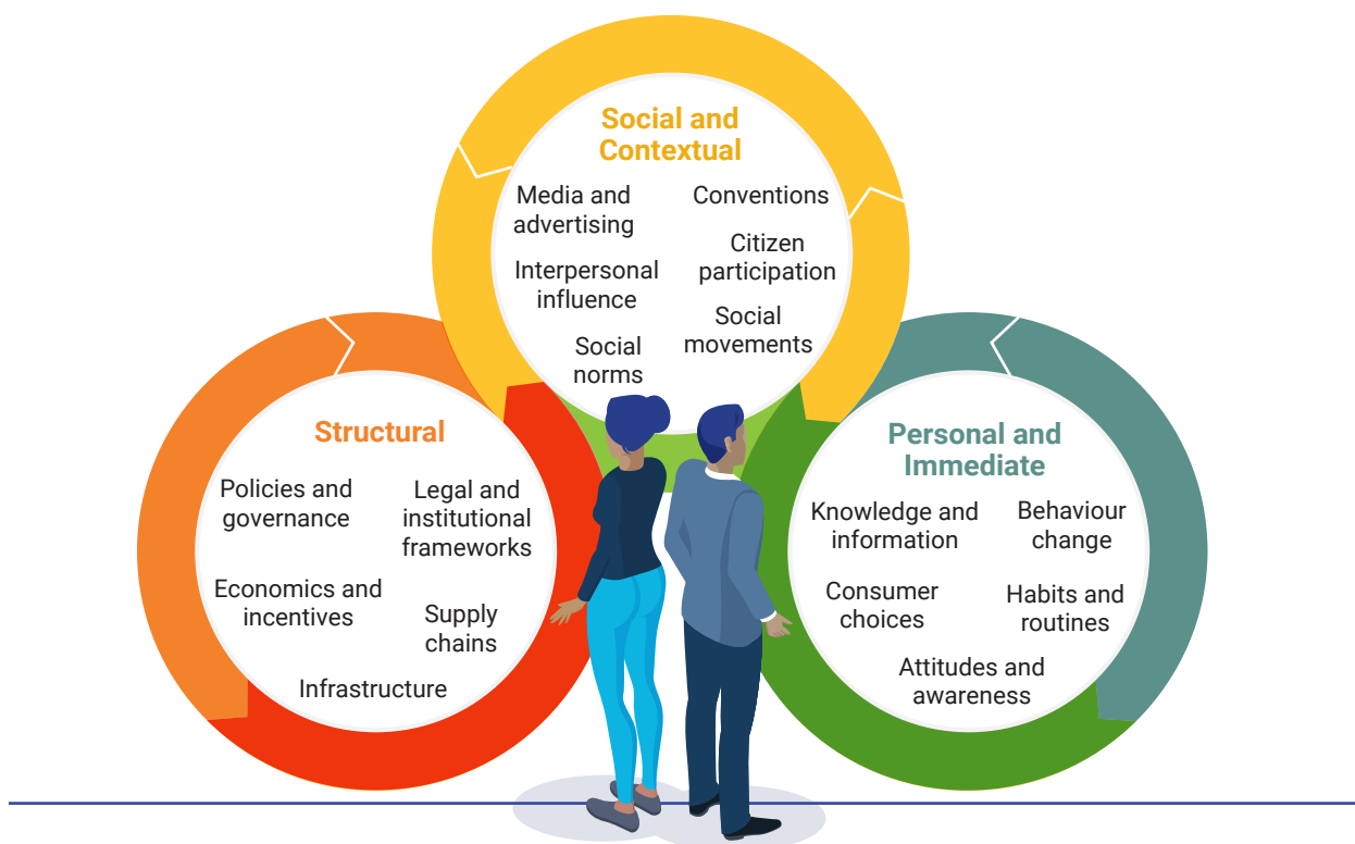
Figure 6.3. Mechanisms to change lifestyles

Note: Personal, social and contextual, and structural factors affecting lifestyle consumption options.