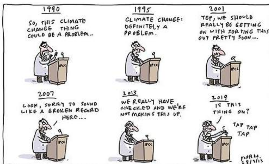
No-one is listening