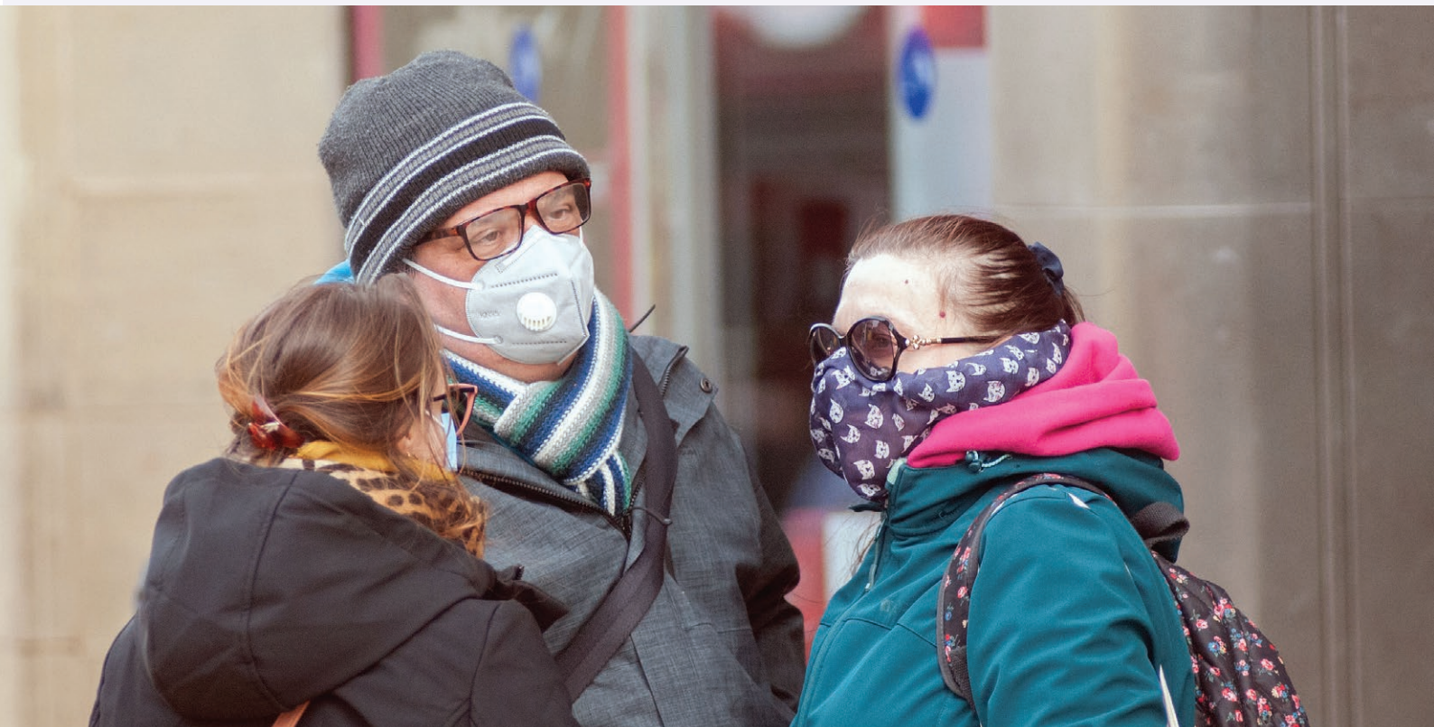
Having a conversation in the era of Covid-19 in the UK.

Where possible, test messaging with different audiences who will be exposed to it - including those you may not be directly focused on, but who may react.