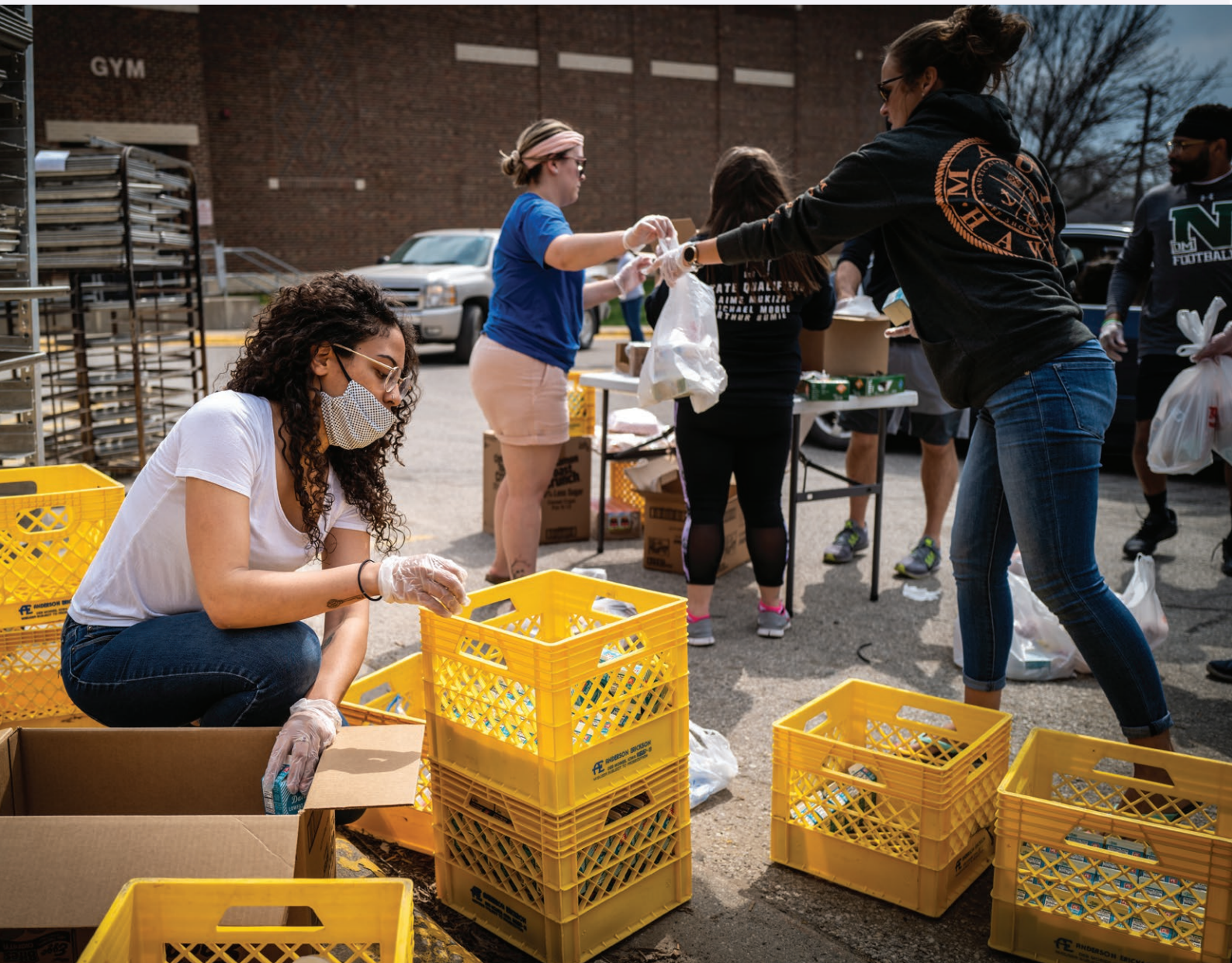
Volunteers handing out free meals and schoolbooks for children whose schools are being closed in Iowa, USA.

“Imagery of people working together could help reinforce the concept of people collaborating in the face of a crisis.”