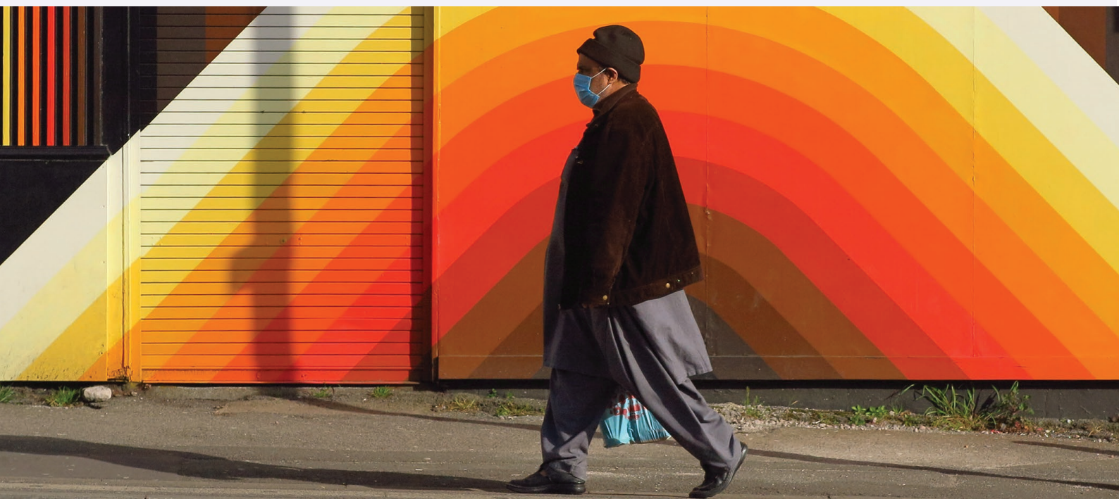
A man wearing a mask returns home from grocery shopping in the UK.

It is not possible to be sure how events will progress, and so it is crucial to keep asking questions about what is happening, reviewing and checking assumptions and evidence as they do.