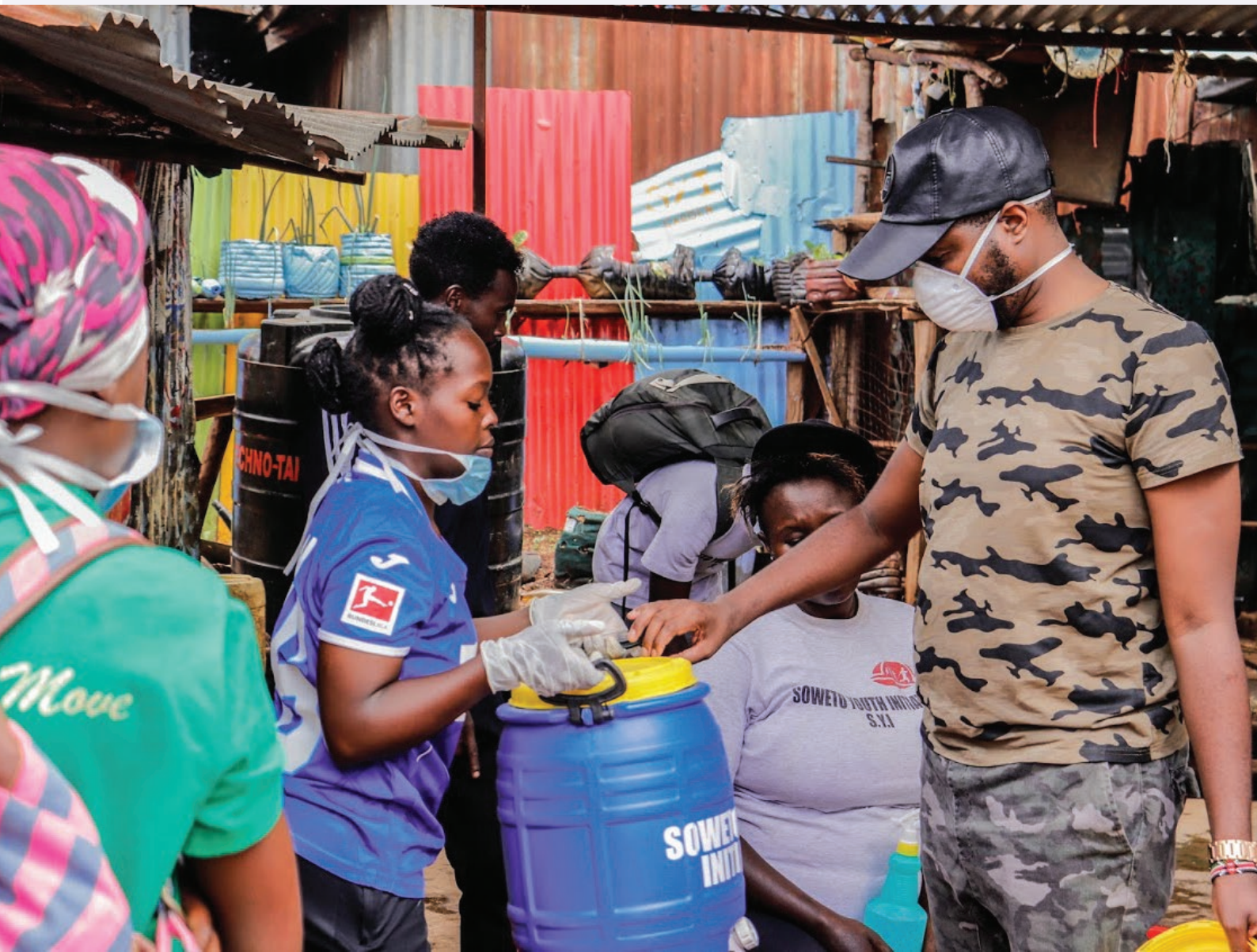
Youth volunteers in Kenya delivering soap to families and setting up community hand washing stations.

“Holding communal values is a strong predictor of pro-environmental behaviour - substantially stronger, for example, than someone’s income.”