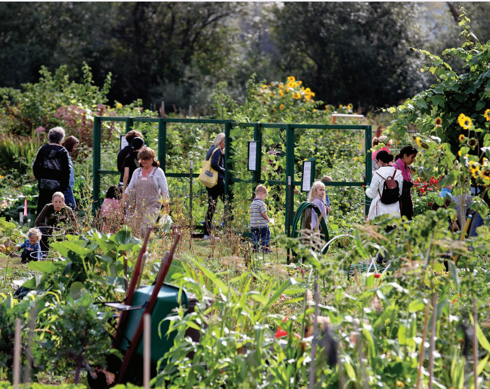
Growing vegetables in a community garden in the US.

Lifestyles around the world have changed rapidly and profoundly in response to Covid-19. The new behaviours may have been adopted for long enough to change ingrained habits. But behaviour is still likely to 'rebound' without government intervention and/or if people see their peers continue with new habits, and new social norms form. Opening up a conversation about which new habits are beneficial for health and quality of life, and how government and society could embed them, could be fruitful.