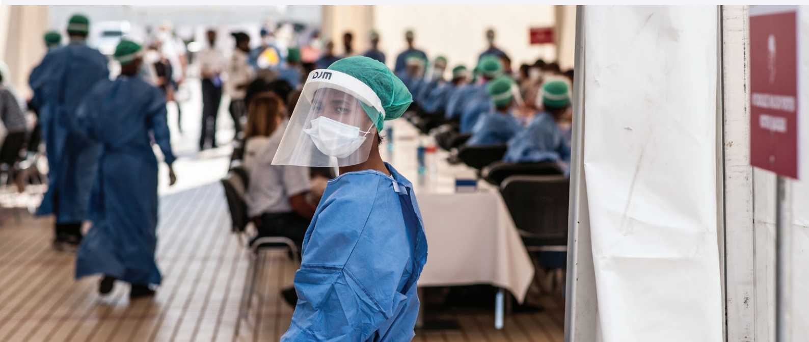
A health worker on the Covid-19 frontline in Madagascar.

Effective climate change communication needs a trusted messenger who shares the values of and understands the needs of their audience . Bringing scientists and health professionals to the fore may be effective as they are trusted voices on Covid-19.