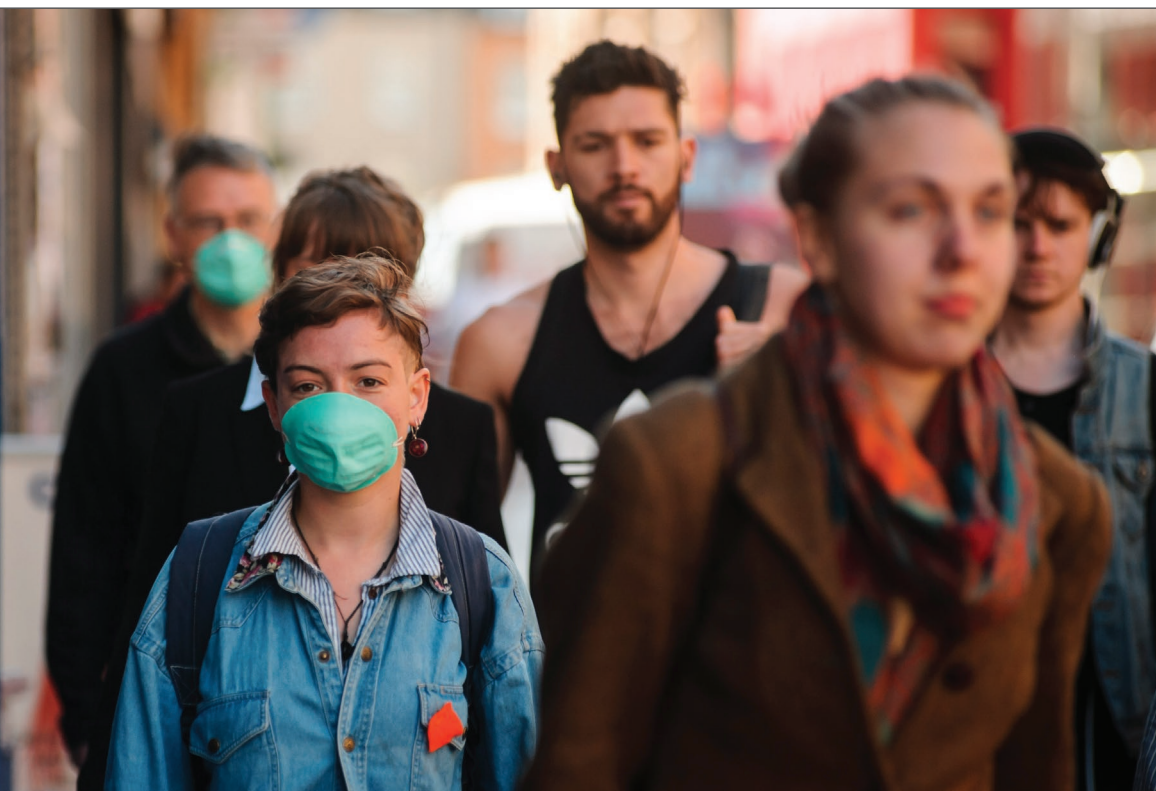
Air pollution is an increasingly recognised risk to health in the UK - campaigners shown here demanded clean air in a zone in Edinburgh which failed to meet Scottish Air Quality Safety Standards.

When asked to assign a set of 20 (hypothetical) tokens across a list of more than a dozen 'priorities' for adaptation policies, the health and well-being of UK citizens , the well-being of vulnerable groups (e.g. the elderly and the very young) and the smooth running of social and emergency services were the top three choices. In comparison, maintaining uninterrupted energy supplies and a transport infrastructure came lower on the list. This suggests that protection against health risks, and maintaining a good standard of wellbeing, is central to the British public's understanding of what adaptation policies should be achieving.