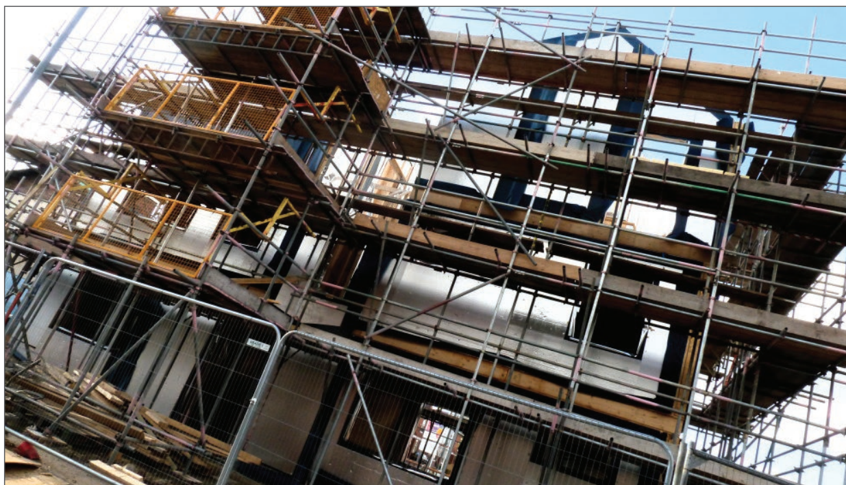
Adaptation policies, such as improving building regulations, are often as popular as policies to reduce carbon emissions. Here, houses in Moss Side, Manchester are renovated incorporating adaptive features as part of an award-winning development.

A cluster of influences are likely to have led to the elevated salience of climate change, including recent media reporting of extreme weather impact events across the UK, Europe and other places in the world. The research took place during the ongoing protests by the 'Fridays for Future' school strike movement, and just after high-profile activity by the Extinction Rebellion group. These are striking examples of concerned publics taking direct political action, many of them for the very first time. The momentum that has built around the idea of treating climate change as a 'climate emergency' is itself a response to the ratcheting up of the urgency in scientific and political discourses. 6