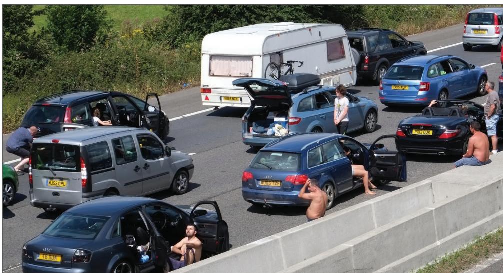
Following successive summers with heatwave conditions in the British Isles, there has been a remarkable rise in concern amongst the British public about the risks from heat and a lack of rain. The 2018 heatwave led to record-breaking temperatures, widespread drought, hosepipe bans, crop failures and a number of wildfires.

Personal experience does seem to be key to the elevated risk perceptions around heat events. Whilst only one in five people said that they had directly experienced flooding in their own home (or knew someone who had), a substantial majority of 70% reported that they, or someone close to them, had experienced discomfort during a heatwave. And more respondents thought they were at risk of heat-stress than thought they were at risk from flooding.