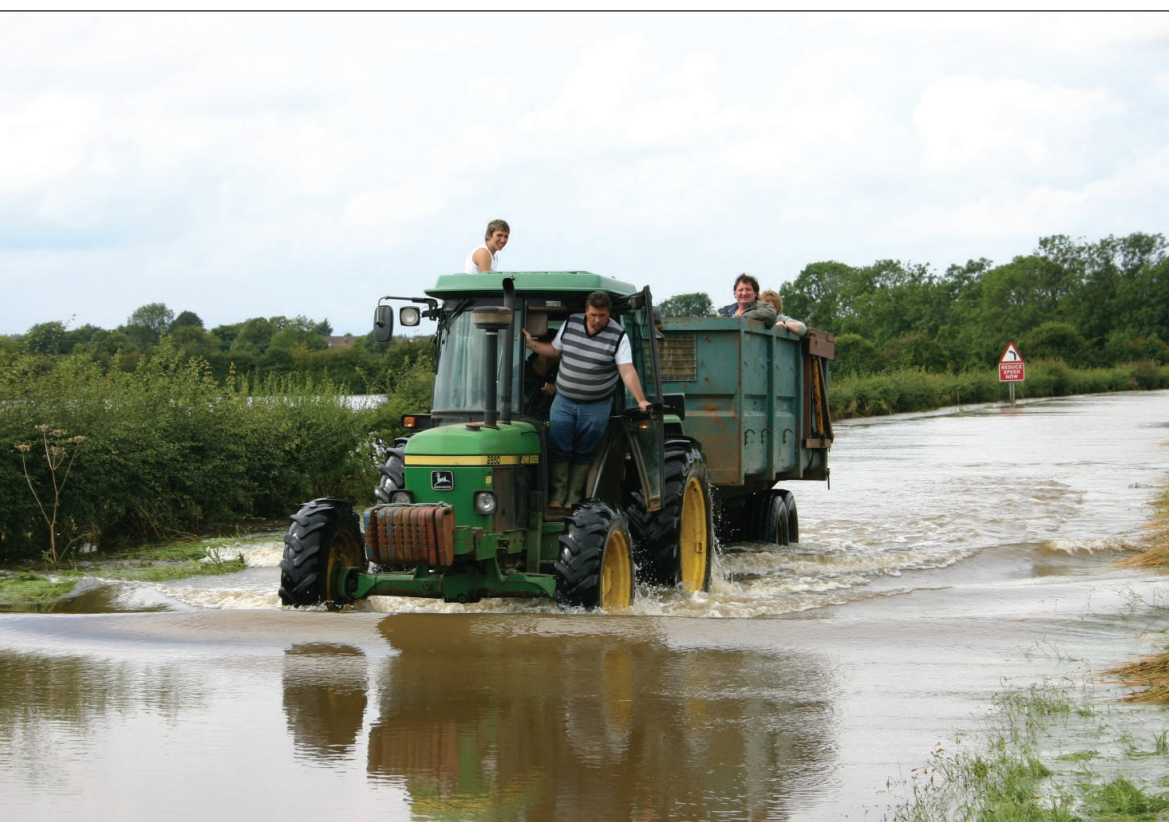
A majority in the UK agree that ‘if people work together’, local adaptation actions are an effective response to climate change. Communications can avoid the sense of powerlessness that can come from reflecting on the risks of a changing climate by recording and celebrating examples of strong preparation by communities affected by climate impacts.

Communications can avoid the sense of powerlessness or loss that can come from reflecting on the risks of a changing climate by recording and celebrating examples of strong preparation by communities affected by climate impacts, providing clear guidance about practical steps households or organisations can take to build resilience, and actively involving people in the shaping of a positive vision of the future, in line with their values.